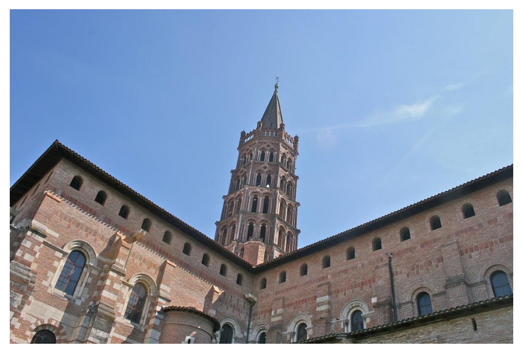
Figure: Under the roof of the nave and transept of the Saint-Sernin basilica in Toulouse, the mirandes restored during the "de-restoration" of Viollet-le-Duc's work © Mike Peel.

Yet, this arsenal of charters and documents is far from creating an unambiguous framework for approaches to conservation and restoration. Just as in the 19th century, today "doing restoration is doing architecture", to quote Viollet-le-Duc. Restoration and conservation projects around the world demonstrate a wide variety of approaches, even within the context of the same monumental complex: The restoration of the vast Angkor complex (Cambodia), for example, which currently involves work by more than 23 countries on 4 continents, is a striking example of a wide range of practices and approaches. The restoration projects carried out by France, China and India ultimately reflect the different approaches of each country and its restorers. To put it schematically, between the cult of ruin on the one hand and systematic anastylosis on the other, European romanticism clashes with the desire to ensure the integrity of monuments as a sign of respect for the monument and its religious role.